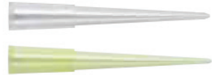
Volume Range 1 to 200µL